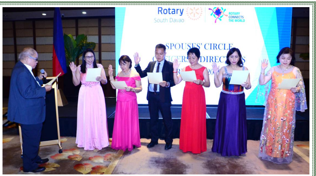
Governor's Visit... July 8, 2019, Marco Polo Hotel