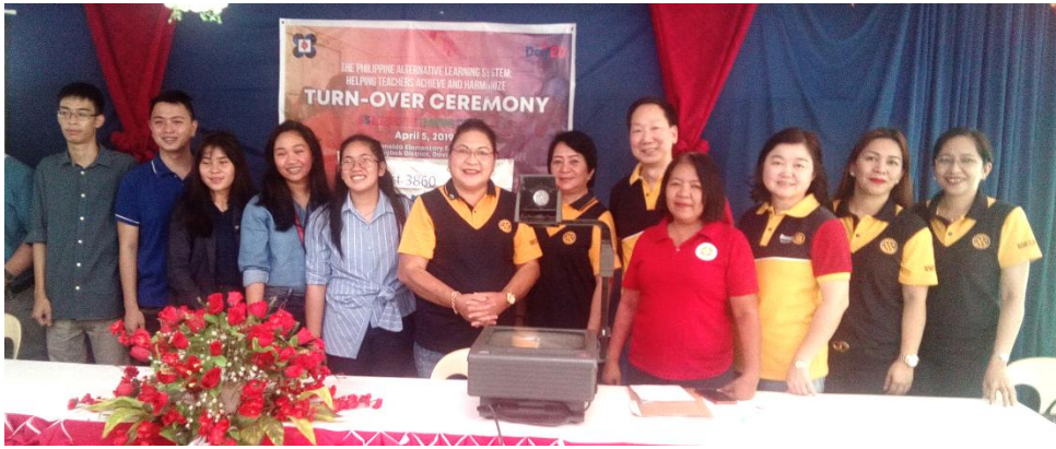
Turnover of 2 units of overhead projectors (donated by DIMDI) to Imelda Elementary School. July 5, 2019