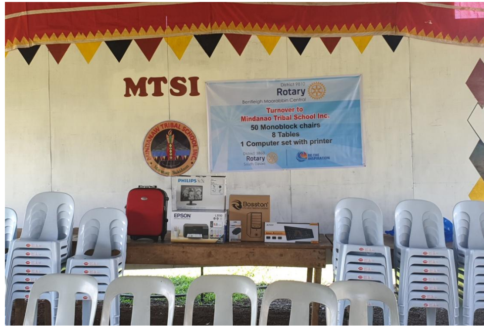
Turnover of 50 monoblock chairs, 8 tables and computer set with printer to Mindanao Tribal School Inc., Maramag in partnership with RC Bentleigh Moorabbin Central, Australia. July 13, 2019